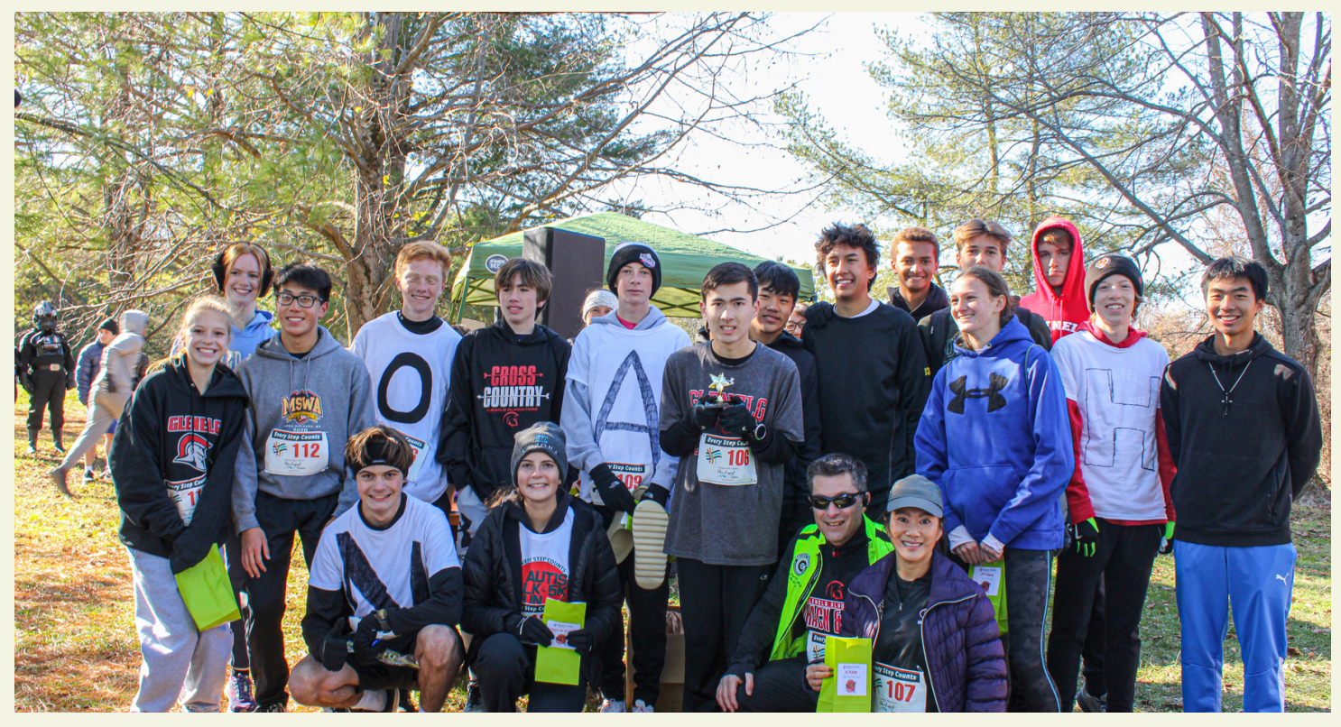
One of the amazing teams who participated in our 2022 Every Step Counts Autism Walk & 5K Run!