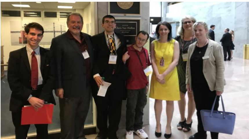
Spending a Day on the Hill as part of the Autism Society of America's National Conference in July 2018.