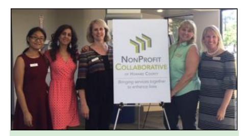
In May 2017 HCAS moved to our new location, the Nonprofit Collaborative of Howard County.