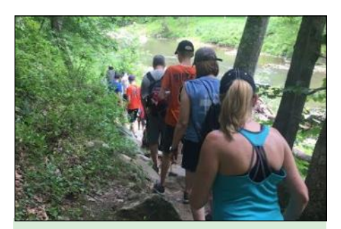
HCAS families started a Hike Club. Hikers enjoy meeting friends and exploring the outdoors.