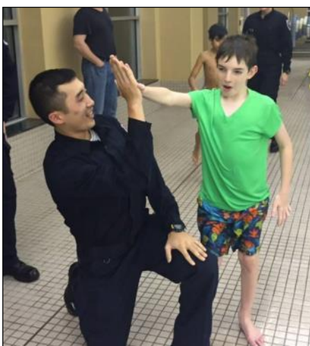
HCAS families socialized with the Howard County Police Department's Academy Class 40 recruits during the annual winter pool party at Lifetime Fitness.