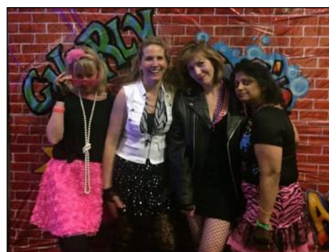
Attendees at the 11th Annual Pieces of the Puzzle Gala embraced the evening's totally rad '80s theme.