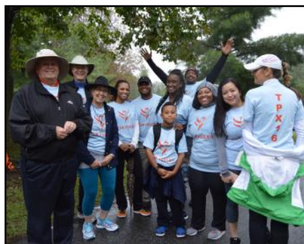
Families and friends braved the rain to support loved ones with autism at the 10th Annual One Step Closer Autism Walk and 5K Run.