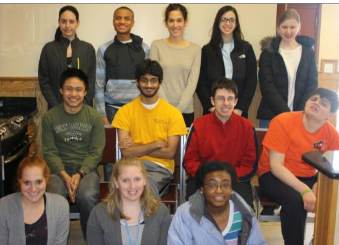
Bottom: HCAS Social groups for young adults and teens teach social and life skills.