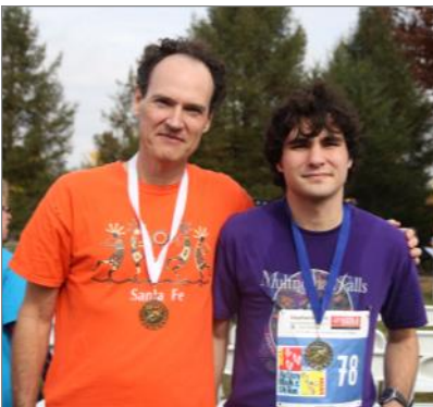
Top and Left: More than 550 walkers and runners participated in the 9th Annual One Step Closer Autism Walk and 5K Run.