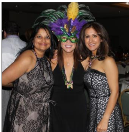
Guests enjoyed the Madri Gras theme at the 10th Annual Pieces of the Puzzle Gala.